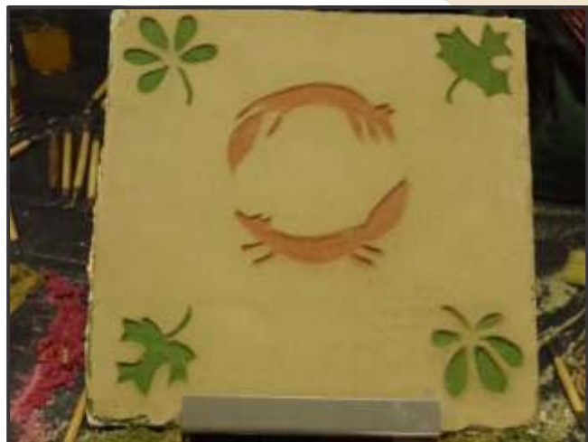
Sgraffito made by the future trainer

From June to September 2013 we did several test trainings for unemployed people from all over Poland. Very fresh trainers (with a bit more experienced architects and plasterers) were training unemployed people in different units. They succeeded – nine of twenty-nine beneficiaries found a job in the field of clay plasters! During October and November 2013 we finished the final form of the products of the project: paper and DVD