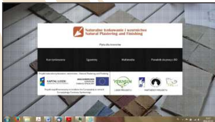
Screenshot from the DVD

From June to September 2013 we did several test trainings for unemployed people from all over Poland. Very fresh trainers (with a bit more experienced architects and plasterers) were training unemployed people in different units. They succeeded – nine of twenty-nine beneficiaries found a job in the field of clay plasters! During October and November 2013 we finished the final form of the products of the project: paper and DVD