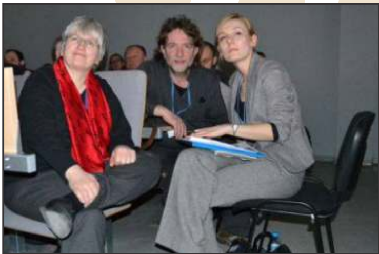
Conference in Poznań (Poland), 27.02.2014.

In January and February 2014 we organised dissemination of our project. Several meetings and taking part in educational and building fairs. It was an opportunity to pass to the Polish market the information: “The clay plasters are here – you can use them – and we're the place where you can learn about it”.