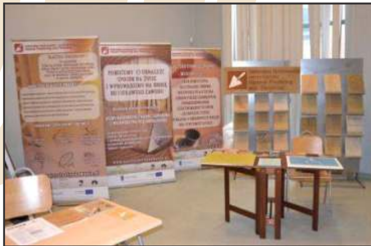
Stands of the project.

In the future we will continue to train new trainers and unemployed people all over Poland. In addition, Venum takes part in different international initiatives concerning earth building.