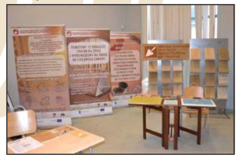
Stands of the project.

In the future we will continue to train new trainers and unemployed people all over Poland. In addition, Vernum takes part in different international initiatives concerning earth building.