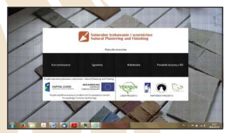
Screenshot from the DVD

From June to September 2013 we did several test trainings for unemployed people from all over Poland. Very fresh trainers (with a bit more experienced architects and plasterers) were training unemployed people in different units. They succeeded - nine of twenty-nine beneficiaries found a job in the field of clay plasters! During October and November 2013 we finished the final form of the products of the project: paper and DVD