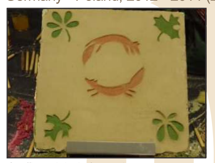
Sgraffito made by the future trainer

From June to September 2013 we did several test trainings for unemployed people from all over Poland. Very fresh trainers (with a bit more experienced architects and plasterers) were training unemployed people in different units. They succeeded - nine of twenty-nine beneficiaries found a job in the field of clay plasters! During October and November 2013 we finished the final form of the products of the project: paper and DVD