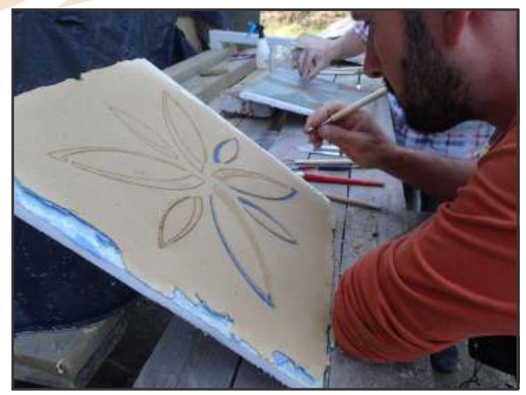
Sgraffito – this is it!